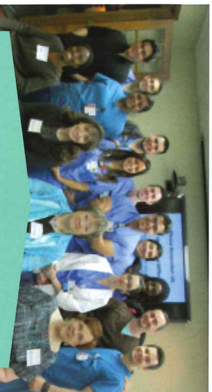
SURVIVORS TEACHING STUDENTS SESSION: PRESENTERS (FOREGROUND) AND STUDENTS (BACKGROUND)

Would you like to share your story to increase medical students' awareness about ovarian cancer symptoms and risk factors? If so, become part of an innovative program called Survivors Teaching Students: Saving Women's Lives® (STS).